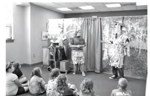
Grantsville Summer Reading Club enjoying the kick-off performance of “Upcycled Cinderella” by Bright Start Touring Theatre

Summer Reading Club is a yearly, cooperative project between the local Maryland Public Libraries and the Maryland State Department of Education’s Division of Library Development and Services. The state also is a member of the Collaborative Summer Library Program, a grassroots consortium of states working together to provide high-quality summer reading program materials for children at the lowest cost possible for their public libraries. (More Photos on Page 4)