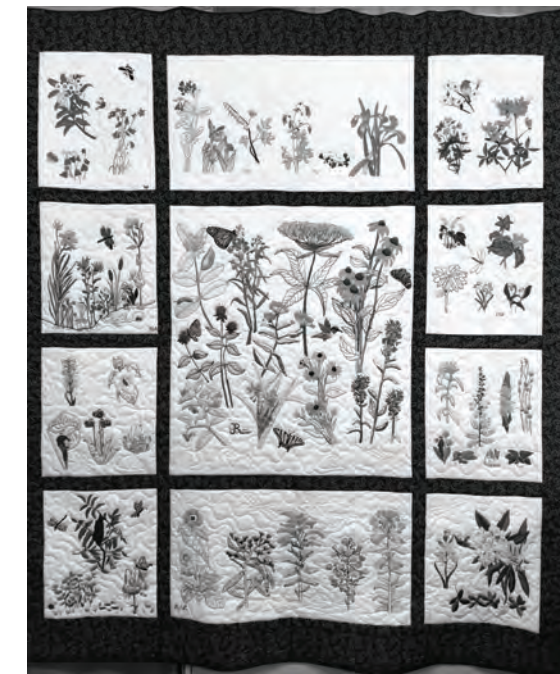
Wildflowers of Garrett County – A Community Quilt